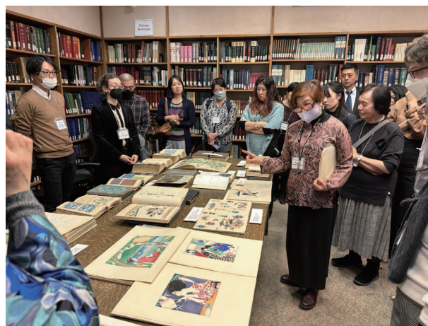
Examining the Harvard-Yenching Institute Collection during the NCC Workshop held at Harvard University